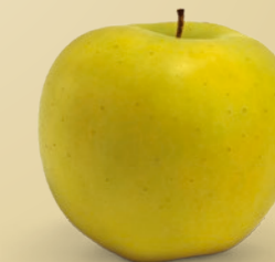
Luna ® The well storable