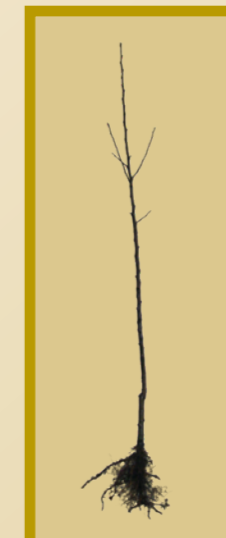
Grafted/occulated unbranched (S0)