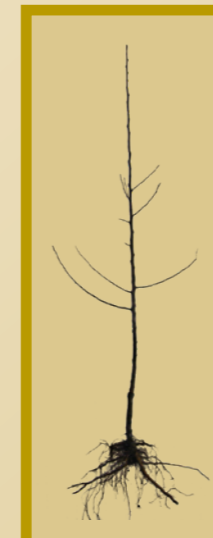
Grafted/occulated Branched/Knip tree min. 3 branches (K3+)