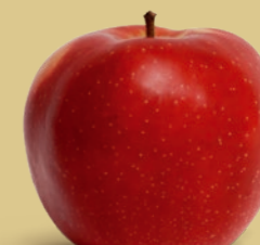
Allegro ® The special