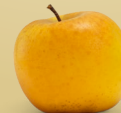
Orion ® The special flavoured sugar apple