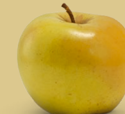
Sirius ® The flavour harmony