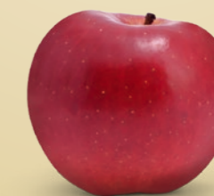
Rozela ® The attractive fruit flow