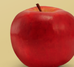
Red Topaz ® The basis of bio production